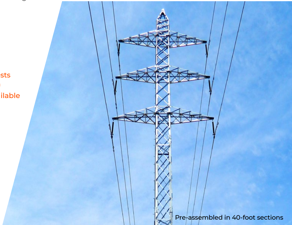
Pre-assembled in 40-foot sections