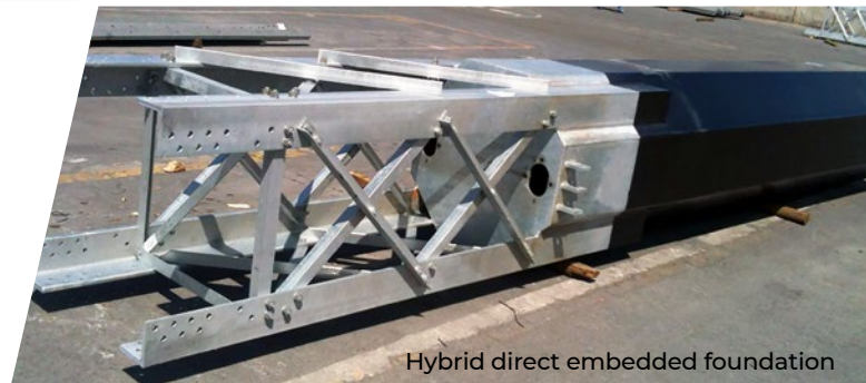
Hybrid direct embedded foundation